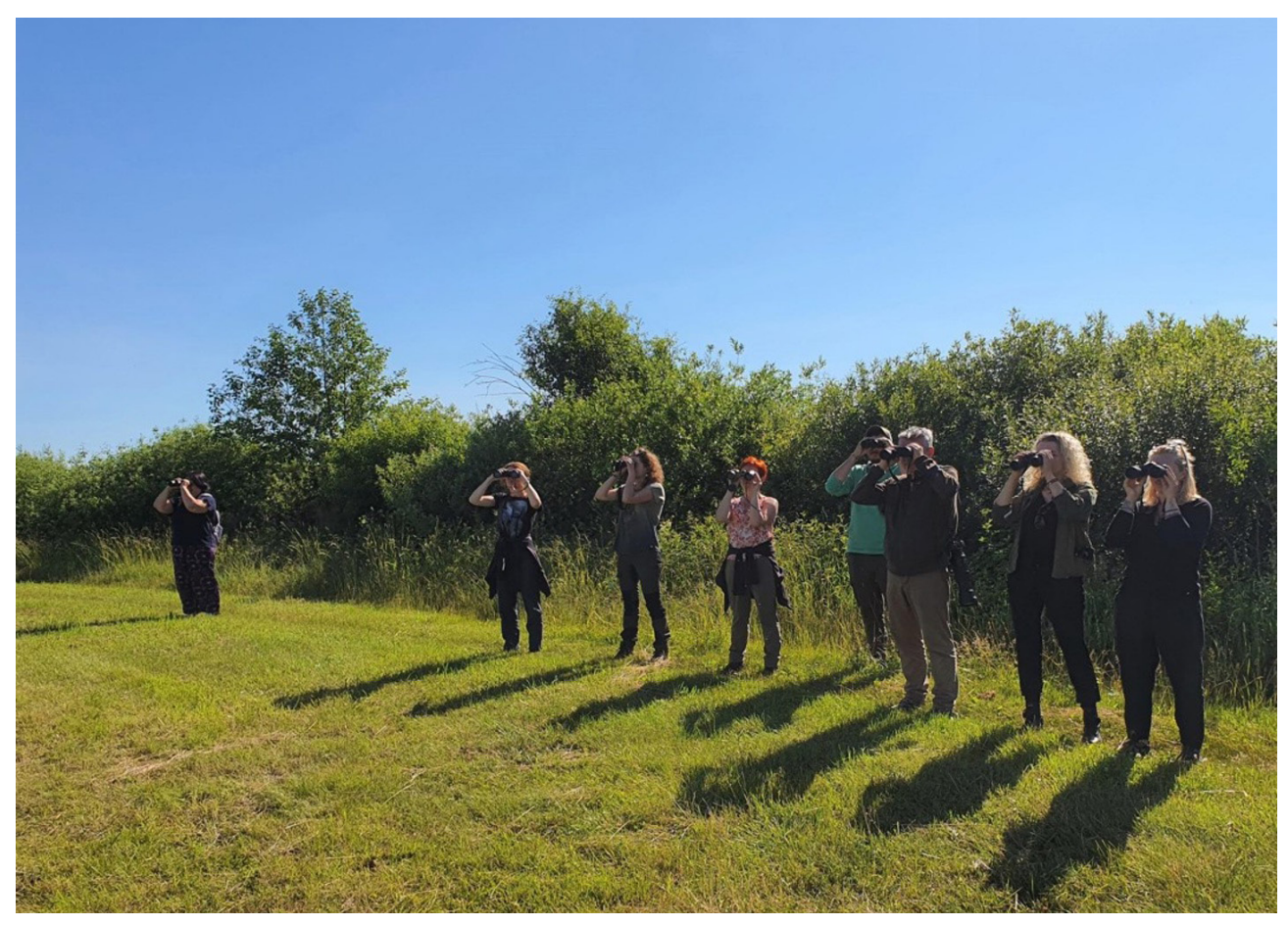
Fig. 2. Participants of the ecotherapeutic program in Biebrza River Valley (Poland) during their field workshop - therapeutic ornithology

focus on the mere recognition of bird species, but is based on mindfulness (Tryjanowski and Murawiec, 2020). Therefore, sensory perceptions, emotions, and cognitive activities accompanying observations (such as classifying, comparing) are essential. The term "bird therapy" appeared in the title of Joe Harkness's book (2020). The above approach is consistent with the one presented in the cited book. In Poland, the original monograph entitled Therapeutic Ornithology was published in 2020 (Tryjanowski and Murawiec, 2020) and became the basis for the development of this therapeutic method.