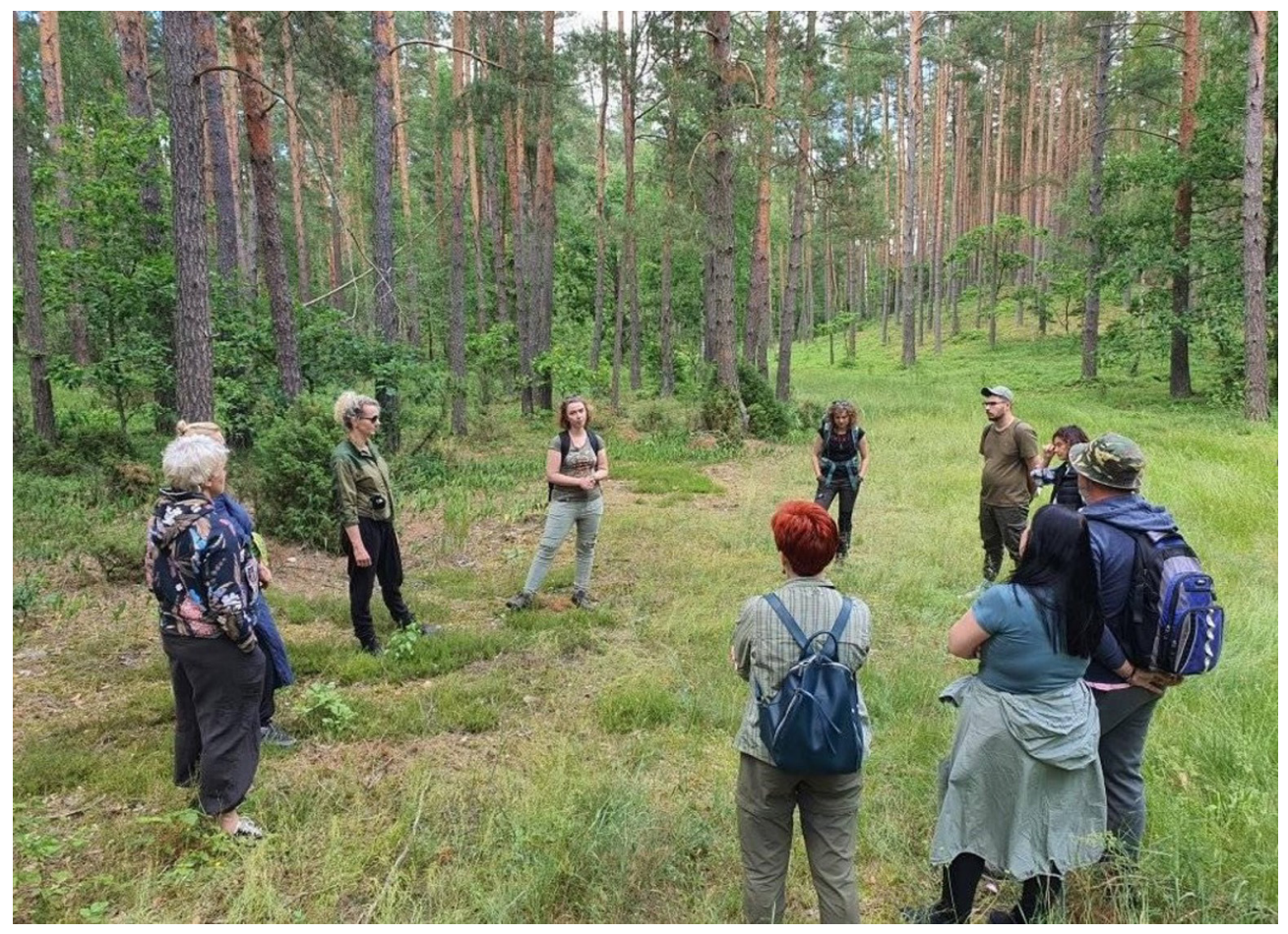
Fig. 1. Participants of the ecotherapeutic program in Biebrza River Valley (Poland) during their field workshop – forest therapy

Therapeutic ornithology includes activities aimed at improving mental wellbeing through various forms of contact with wild bird species: field trips (Cammack et al., 2011), observations in the garden (Murawiec and Tryjanowski, 2020), feeding (Cox and Gaston, 2016; Ratcliffe et al., 2013), listening (White et al., 2018), photographing and other activities (Cox and Gaston, 2015; Tryjanowski et al., 2022). In contrast to bird walks, therapeutic ornithology does not